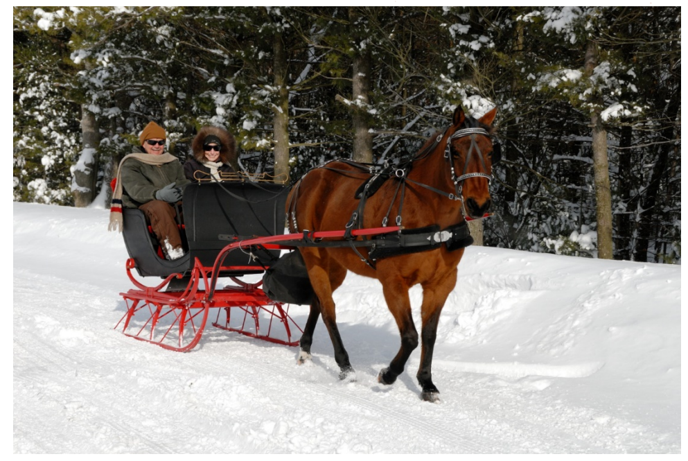
January, 2020, Newsletter